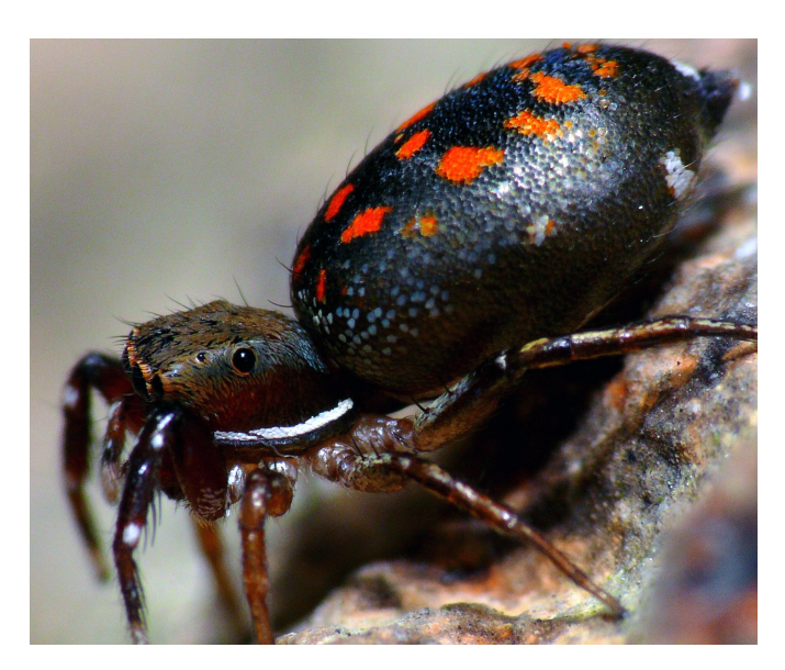
Fig. 3. Gravid female Natta horizontalis Karsch 1879 (type of Natta ), from Richards Bay, South Africa. If you zoom in on this remarkably detailed photograph, you can see individual rounded scales on the opisthosoma, and the more frequently encountered elongated scales on the prosoma. The overlap of the array of opisthosomal scales is much greater when this spider is not gravid. This species is widely distributed across the African continent.<sup>3</sup>