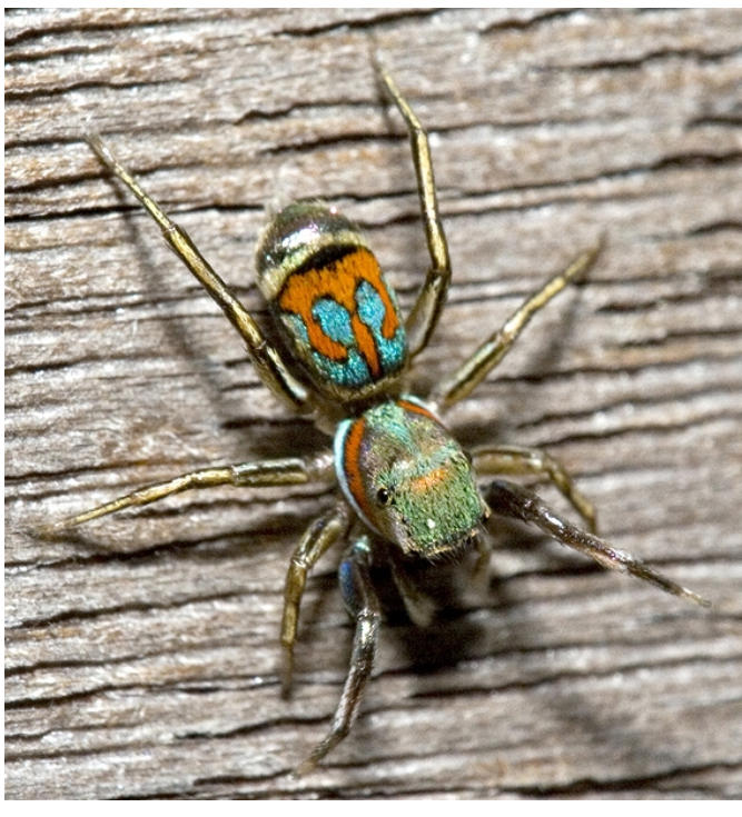
Fig. 4. Female Siler semiglaucus (Simon 1901a), from Singapore. Photograph by Marcus Ng.<sup>3</sup> Note the absence of the dark black bottle brushes found on tibia I of the male. The areas of bright, iridescent blue scales are joined on each side of the opisthosoma.

Several color photographs, at least of female Siler semiglaucus or a related species, are available (Murphy and Murphy 2000, Prószyński 2000b). The female Siler shown here (fig. 4), from Singapore, is similar to those earlier photographs of S. semiglaucus .