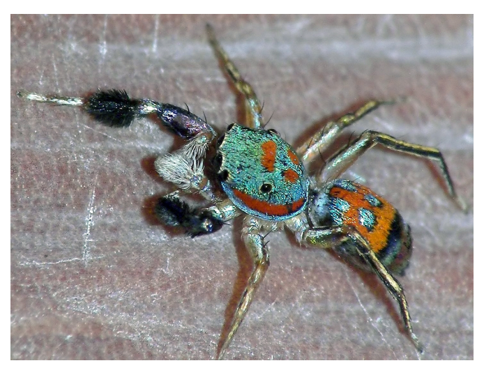
Fig. 6, Second view of the adult male Siler from Hong Kong shown in fig. 4, with a lateral perspective.<sup>3</sup> In this lateral view, the long, black dorsal-ventral bottle brush setae of the male tibia I can be seen clearly, as well as a smaller group of dark setae on the underside of femur I.