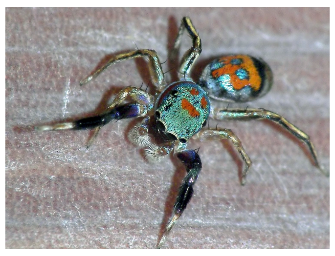
Fig. 5, Dorsal view of an adult male Siler from Hong Kong.<sup>3</sup> The dorsal-ventral bottle brushes on tibiae I cannot be seen in this dorsal view. Note the distinct separation of two patches of iridescent blue scales on the dorsal opisthosoma. This spider was missing leg L3 (left III).

Prószyński's (1985) description and drawing of the dorsal opisthosoma of S. collingwoodi agree with the male Siler from Hong Kong depicted here in figs. 5 and 6.