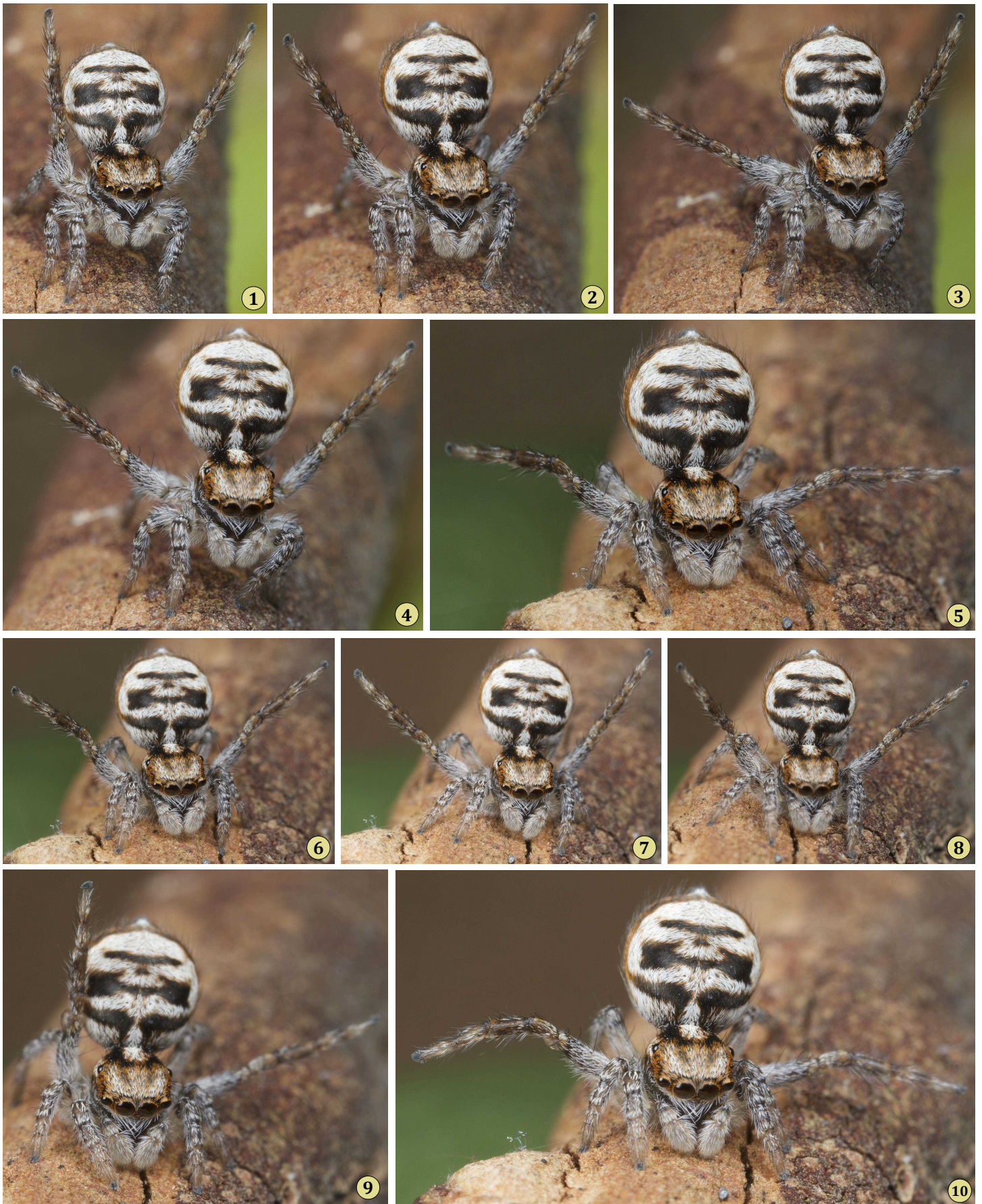
Figure 1. Various display positions of this penultimate male Maratus speciosus in front of the adult female. Note the asymmetric positions of legs III in (9). As in the adult, the fan was expanded and bore three prominent transverse figures.