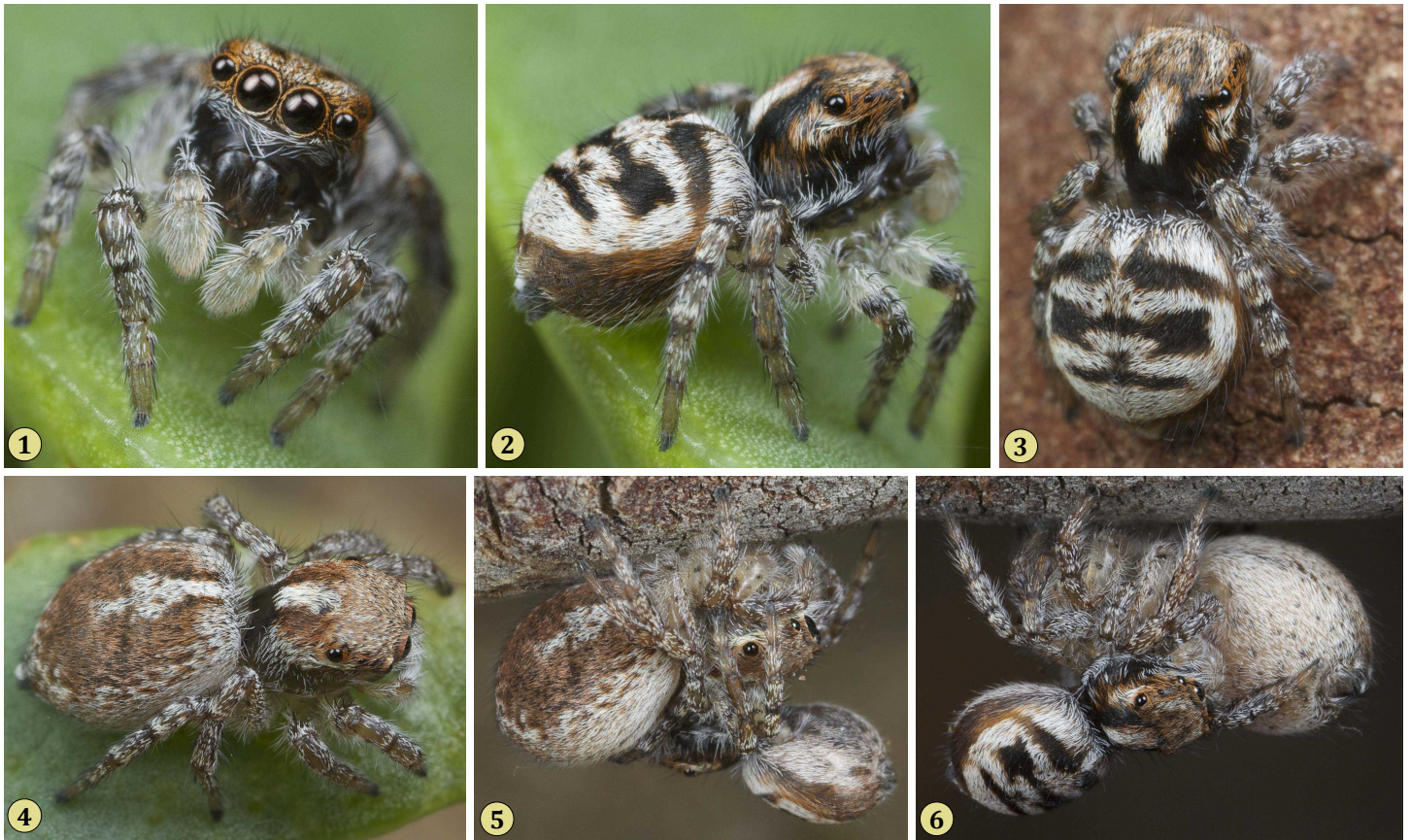
Figure 4. Other views of the penultimate male (1-3), the adult female (4), and the penultimate male attempting to mate with the adult female (5-6). As with adult males, during the final approach to the female this penultimate male extended legs III, touched the carapace of the female with legs I, and frequently bobbed or vibrated his opisthosoma up and down.

The combination of early (penultimate) adult behaviour, late change into adulthood, and short life-span in the adult stage suggests that development of behaviour and physical development of this male were somehow out of sync, perhaps also a result of rearing in captivity. However, we cannot rule out the possibility that display by penultimate Maratus speciosus might occur under natural conditions since display by these spiders has not been studied in the field. Even if this behaviour is the result of rearing and does not occur in nature, the fact that normal synchronization of behavioural and physical development can be violated is of interest. Although some elements of adult display have previously been observed in penultimate male spiders ( e.g. , Crane 1949, Aspey 1975), successful completion of courtship display to the point of attempted mating is unusual.