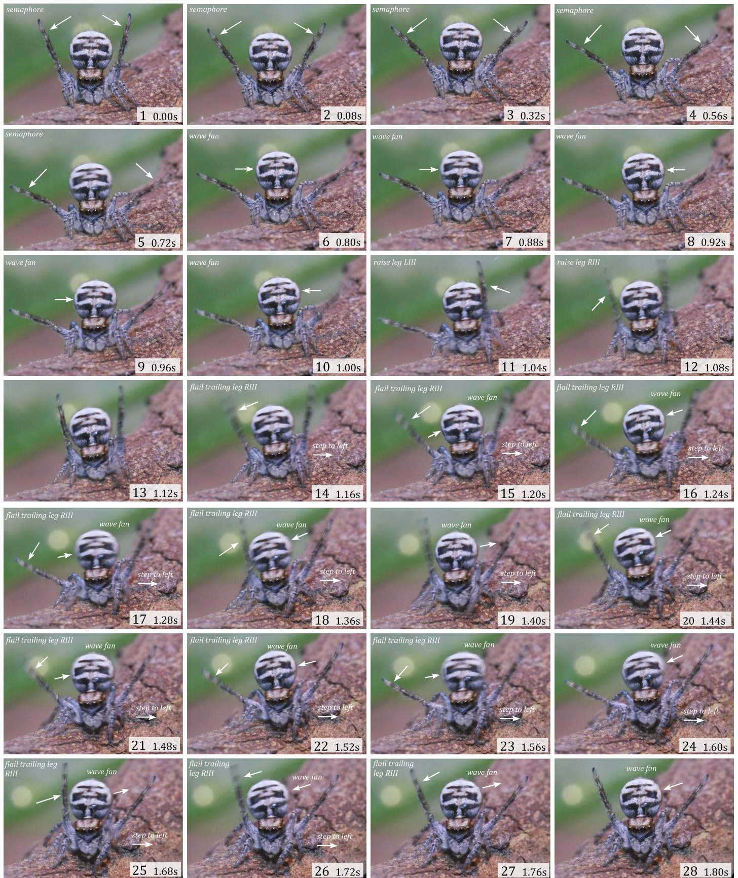
Figure 2. Sequential (1-28, not all consecutive) frames from a video clip (25FPS, 20msec exposure/frame) of the penultimate male displaying to the adult female Maratus speciosus . After stepwise lowering of legs III in a semaphore display (1-5), the fan was waved (6-10) and legs III were elevated asynchronously (11-12) at the start of fan dance to the spider's left (14-28).