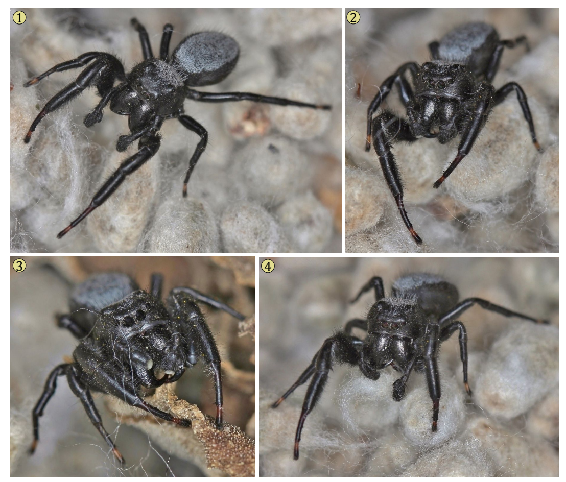
Figure 4. Male Phidippus octopunctatus from El Tejocote, Queretaro de Arteaga, Mexico (18 SEP 2010).