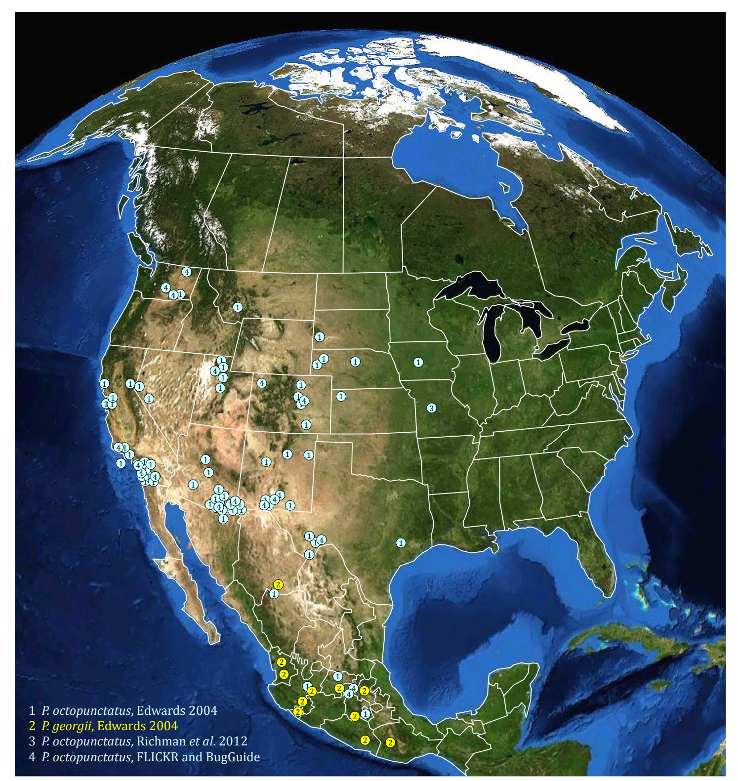
Figure 1. Localties associated with Phidippus octopunctatus and P. georgii in western North America, numbered to indicate source.