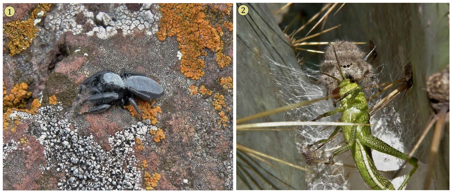
Figure 5. Phidippus octopunctatus from Queretaro de Arteaga, Mexico. 1, Male on exposed rock, La Loma (2 SEP 2009). 2, Female with large grasshopper on cactus, El Tejocote (20 SEP 2010).