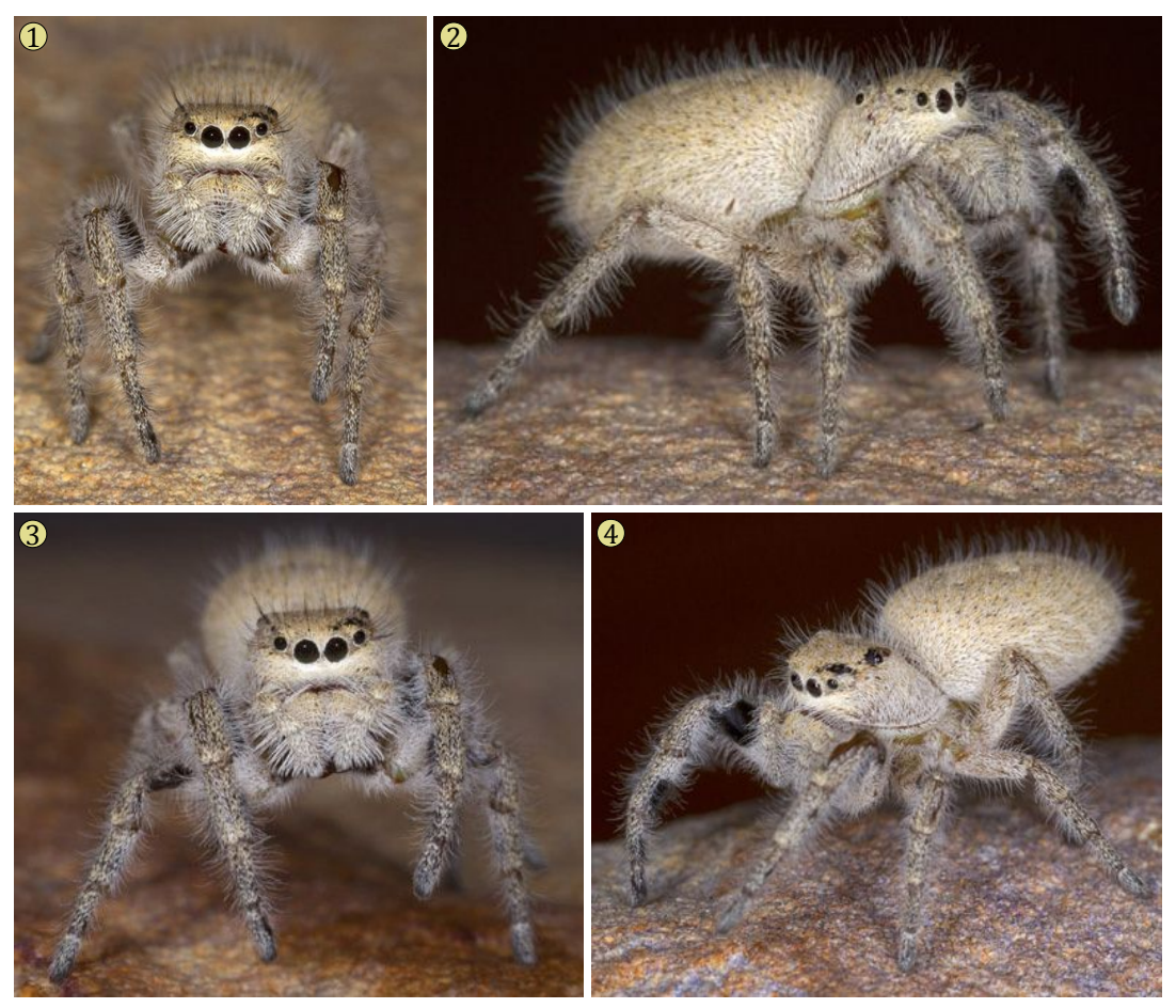
Figure 2. Female Phidippus octopunctatus from the vicinity of San Diego, California.