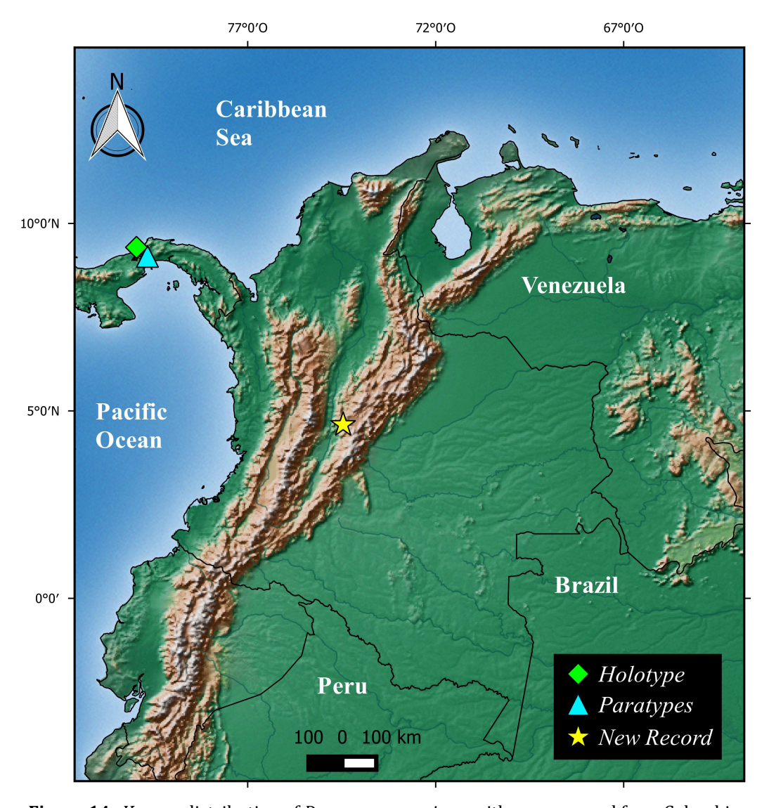
Figure 14. Known distribution of Descanso peregrinus , with a new record from Colombia.

Comment. This is the first record of the species since its original description (see Chickering 1946).