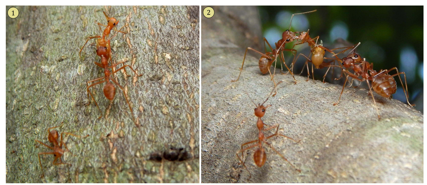
Figure 2 (continued on next page). Attack on an adult female Myrmarachne plataleoides by members of an Oecophylla smaragdina colony in Mysuru, Karnataka, India (6 NOV 2016). 1, Attack by a single worker (14:43). 2, Recruitment (14:44). At this stage most of the recruited attackers were holding legs of the captured spider.

One of the authors (PR) observed a colony of these weaver ants and their mimic jumping spiders in Mysuru, Karnataka, India for about three years without observing any instances where a jumping spider was captured by an ant. During this time M. plataleoides were observed wandering in the ants' territory and nesting in close proximity to them. On 6 NOV 2016 what appeared to represent an attack by an O. smaragdina worker on another ant was captured in the series of photographs shown in Figure 2.