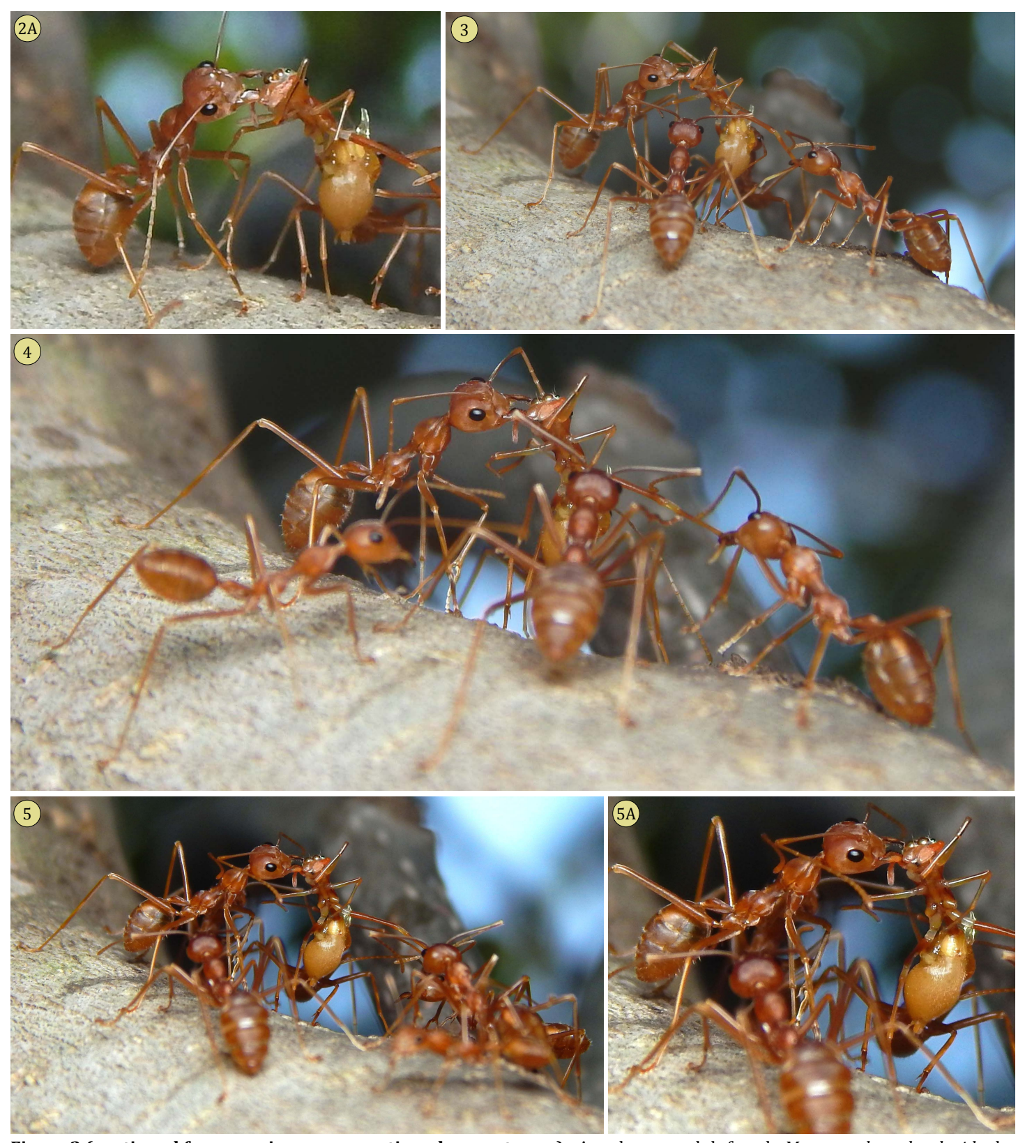
Figure 2 (continued from previous page, continued on next page). Attack on an adult female Myrmarachne plataleoides by members of an Oecophylla smaragdina colony in Mysuru, Karnataka, India (6 NOV 2016). 2A, detail of [2]. Note liquid exuding from book lungs of the victim under pressure. 3-5, More recruitment (14:44). 4, Note the ant at right holding one leg of the captured spider in its mandibles. 5A, Detail of [5].