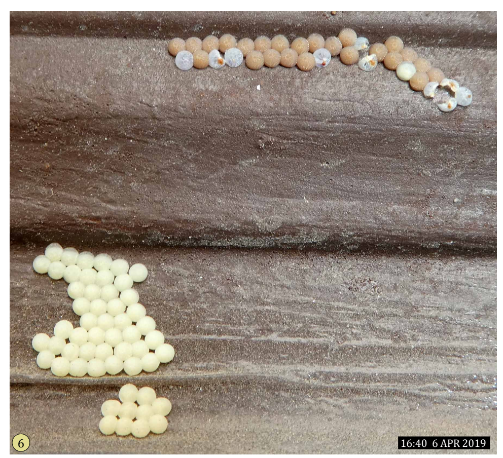
Figure 6. Two days later most of the uneaten eggs in the top cluster were brown, suggesting that they were developing normally. Eggs in the cluster at lower left, not attacked, were still white.