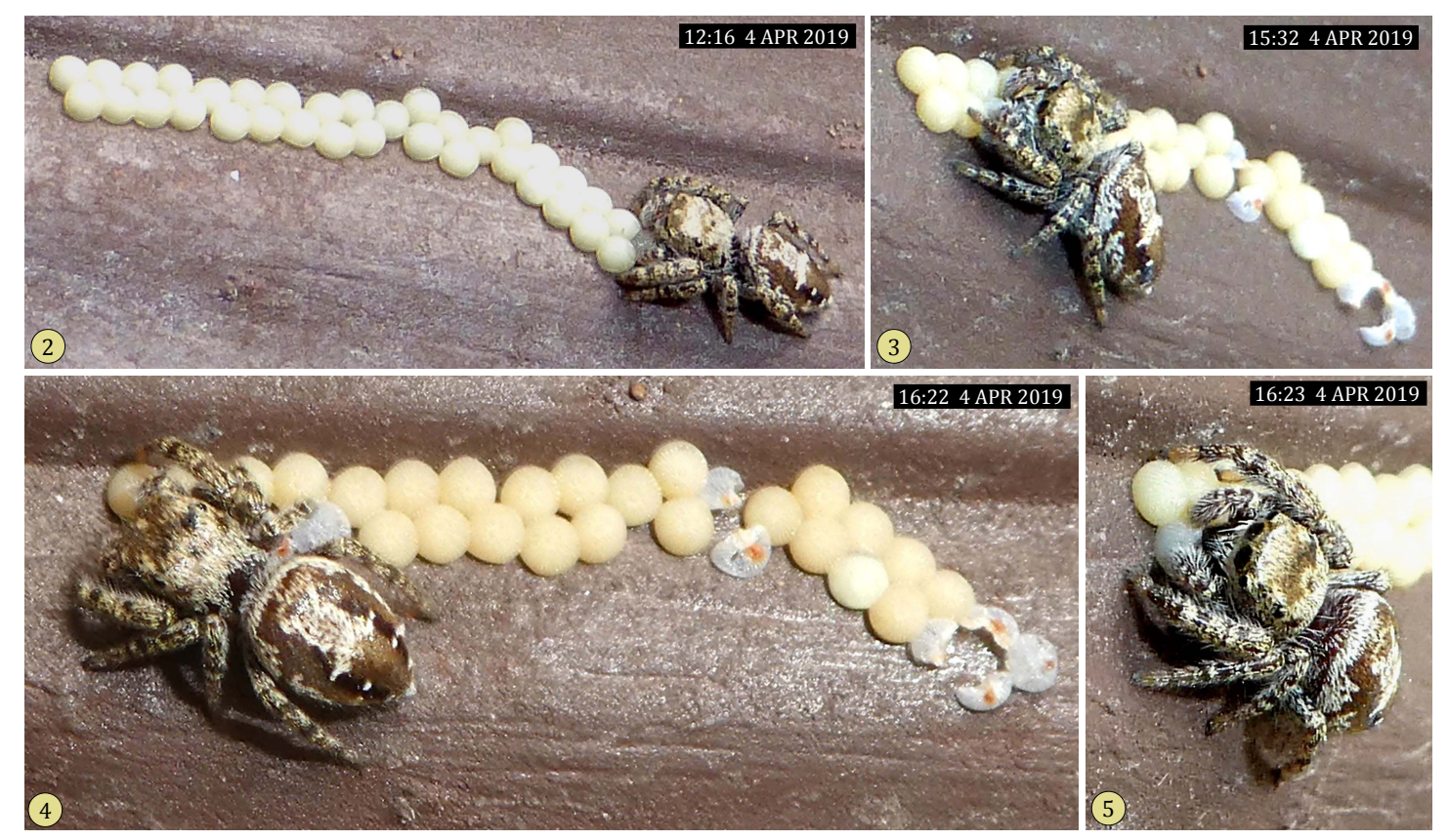
Figures 2-5. Female Pelegrina cf. aeneola feeding on one cluster of the insect eggs. 2, Approaching and consuming the first egg. 3, Consuming her ninth egg. Notice the empty eggshells left behind. 4-5, Consuming the last of 10 eggs in total that were eaten.