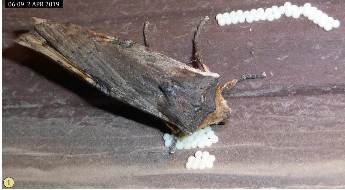
Figure 1. A female Gray Swordgrass Moth, Xylena cineritia , near two clusters of recently-laid eggs. The cluster at top right was later attacked by a female Pelegrina cf. aeneola (Figures 2-5).

With the onset of spring and with nighttime temperatures beginning to stay above freezing, I typically resume my habit of leaving the front porch light on for the evening to observe light-attracted moths and other insects and arthropods at my home in Missoula, Montana, USA. At approximately 6:08 AM on April 2, 2019 I inspected the area around my front door and found a Gray Swordgrass Moth, Xylena cineritia (Grote 1874) near two new clusters of eggs on the doorframe (Figure 1), both deposited since the previous evening. X. cinerita is a widely distributed noctuid moth that overwinters as an adult, ranging from the northern United States and southern Canada to Alaska (Rockburne & Lafontaine 1976; Wagner et al. 2003; Landholt et al. 2007). Although this moth was near both egg clusters, I cannot be certain that it deposited either egg cluster. In one cluster (Figure 1, upper right) the eggs were deposited in two regular rows. In the other cluster, eggs were deposited in a single space-filling layer but not in rows.