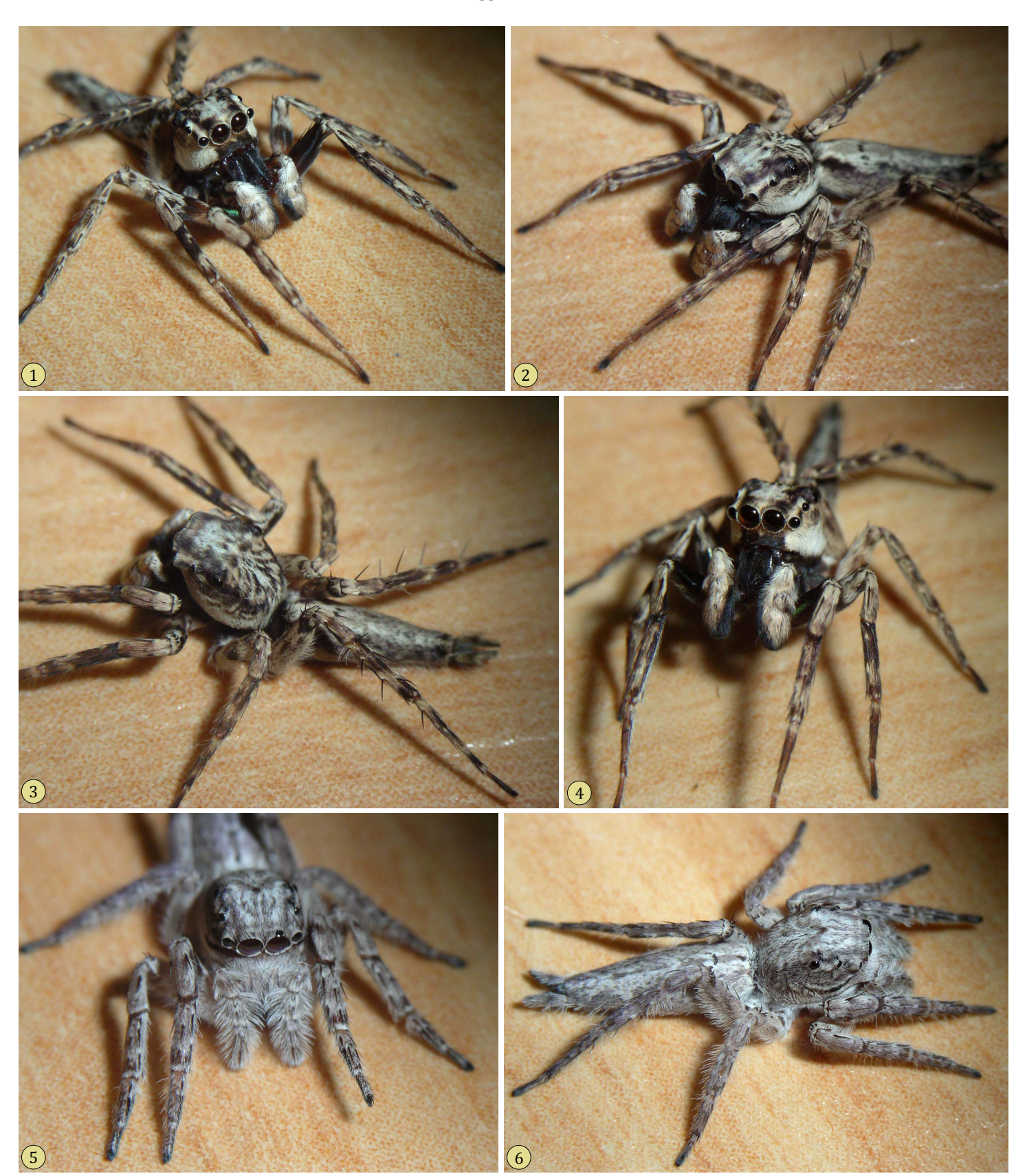
Figure 2. Cocalus sp. from Singapore and Malaysia. 1-4, Adult male from Lim Chu Kang mangrove, Singapore (1.44N 103.70E, SGM05-3088, record 12 in Figure 1). 5-6, Adult female from Ulu Gombak Field Station, Selangor, Malaysia (3.325N 101.753E, SGM05-4675, record 13 in Figure 1). All photos (1-6) copyright © Wayne P. Maddison (Maddison 2015), used under a <u>CC-BY 3.0</u> license.