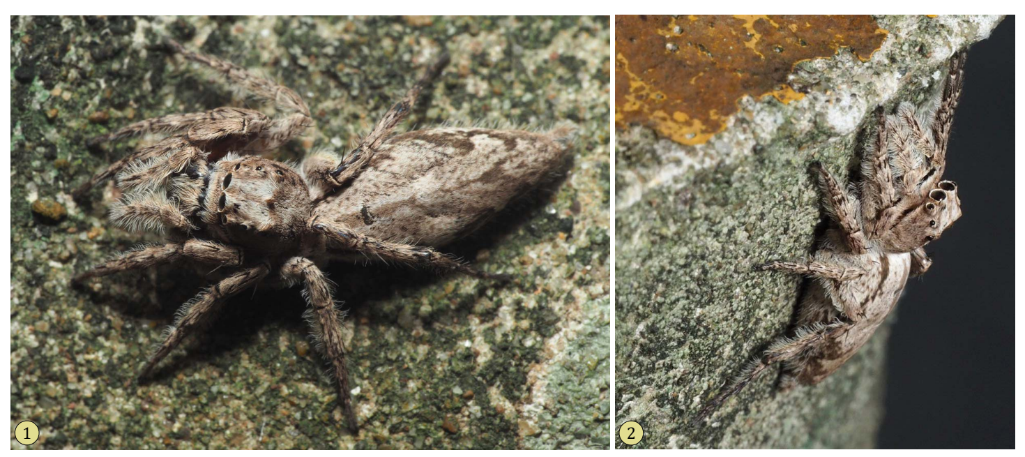
Figure 3. Adult female Cocalus concolor Sai Kung, Hong Kong, 16 JUL 2018. This corresponds to record 2 in Figure 1.

The few available photographic records for this genus are usually not identified to species (e.g. Maddison 2015; Caleb 2016). In addition, the behavior of Cocalus species is little-known, with the exception of a single paper on the predatory and nesting behaviour of C. gibbosus in Australia (Jackson 1990). Cocalus have previously been found on the bark of a fallen tree in Tamil Nadu (Caleb 2016), and on the tree bark of Tectona grandis (Lamiaceae) in Kerala (Sudhin et al. 2019). Cocalus is one of the few tropical Afroeurasian spartaeine genera that have crossed Wallacea and now have a limited representation in Australasia (Hill 2010).