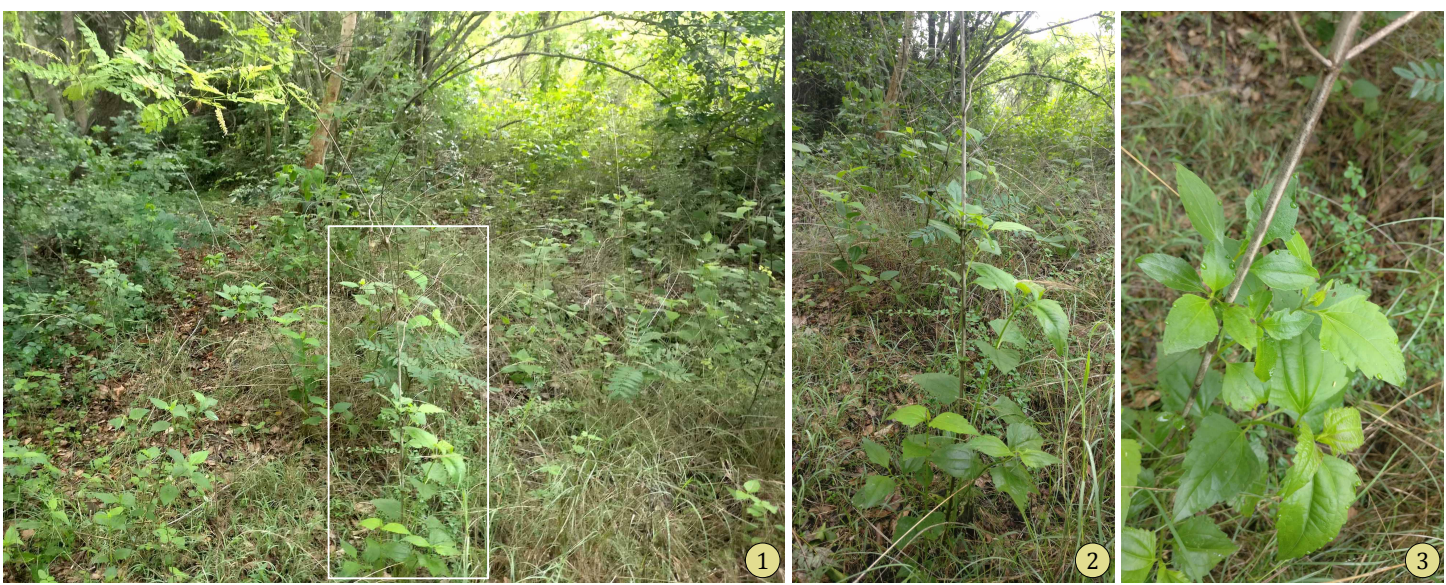
Figure 5. Three views of the Siam Weed in the Turahalli forest of southwestern Bengaluru where this brooding Cocalus was found. 1, Siam Weed identified in inset rectangle. 2-3, Note the dry stem at the top of this plant where the egg-sac was located.