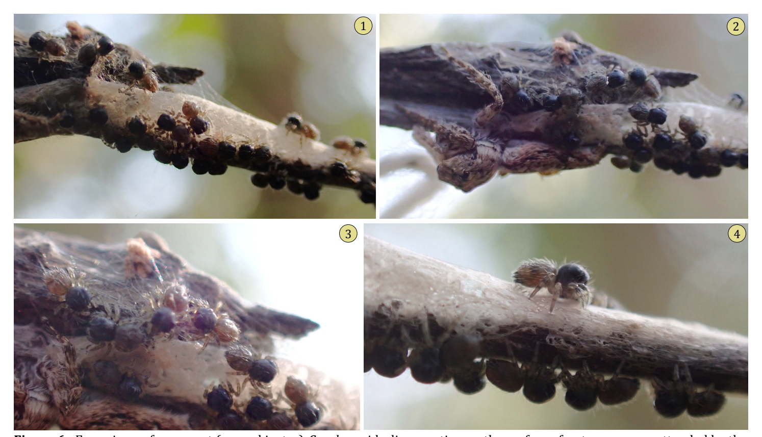
Figure 6. Four views of emergent (second instar) Cocalus spiderlings resting on the surface of a stem egg-sac, attended by the female (visible beneath stem in 2), in Puttur, Karnataka.