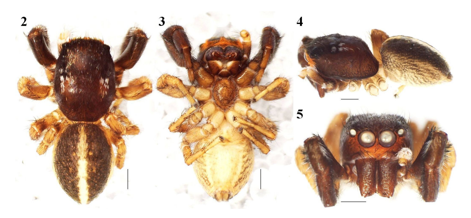
Figures 2-5. Pellenes bonus Logunov, Marusik & Rakov, 1999, male, habitus. 2, Dorsal view. 3, Ventral view. 4, Lateral view. 5, Frontal view. Scale bars: 0.5 mm.

Prosoma dark brown, covered with dark hairs. PME with tufts of bristles posteriorly (Figure 2). Clypeus narrow, light brown, densely covered with black and orange color hairs. AME surrounded by dense orange hairs. Chelicerae long, dark brown, with dark hairs (Figure 5). Sternum yellowish-brown (Figure 3). Abdomen dark brown, dorsally with a white longitudinal line, ventral yellowish gray and covered with white hairs (Figure 2). Leg I dark brown, densely covered with dark hairs. Legs II-IV light brown and covered with dark hairs. Spinnerets yellowish-brown (Figure 2). Pedipalp light brown with dark hairs. The tibia of the pedipalp with long dark hairs, and the patella with white long hairs. Cymbium protrudes by curving outwardly in the dorsal direction (shown with an arrow in Figures 14-15). The tip of this protrusion is toothed and there is another protrusion in the form of a hillock in the middle. Bulb broad and protruding outwardly. The embolus is narrowing towards the tip. Pedipalp as in Figures 6-15.