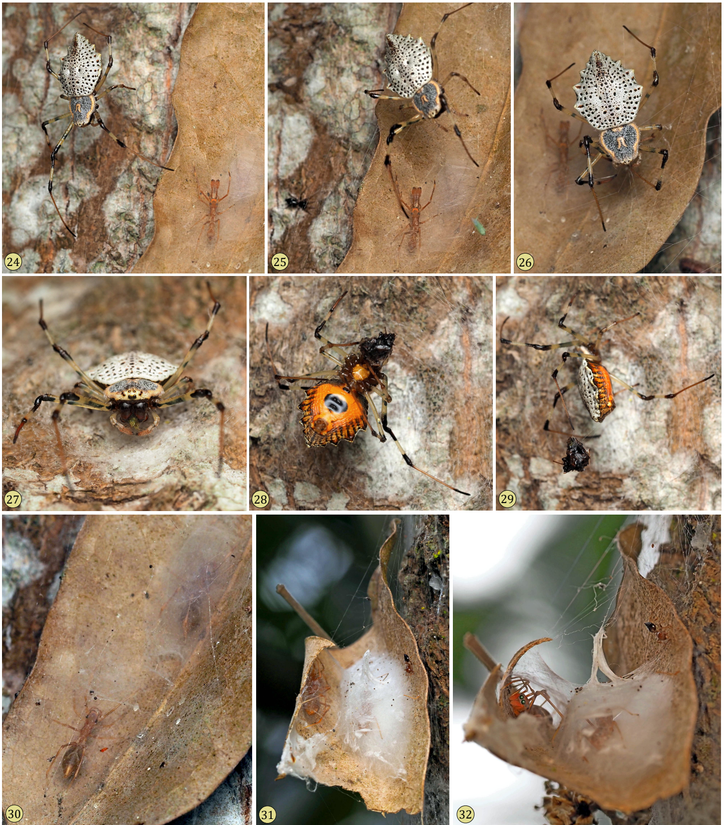
Figures 24-32. 24-26, Herrenia moving over nest #2, occupied by a male Myrmarachne plataleoides tending a female, to capture a leafhopper (25, lower right). 27, Herrenia feeding at the center of her web. 28-29, Herrenia wrapping a different prey at the center of her web. 30, Two female M. plataleoides on the lower part of the Tabebuia leaf (nest #2 at top), before this leaf was broken. 31-32, Two female M. plataleoides occupying adjoining shelters on a fragment of the broken Tabebuia leaf.