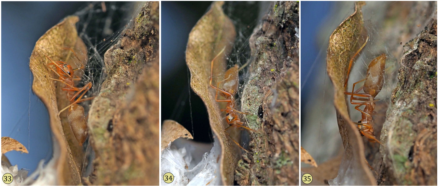
Figures 33-35. Female Myrmarachne plataleoides sheltering beneath fragment of the broken Tabebuia leaf.

The entire site for these observations was occupied by many foraging Green Tree Ants ( Oecophylla smaragdina ), with a major vertical route on a thick vine to the right side of the Herrenia web (Figures 1, 36-38).