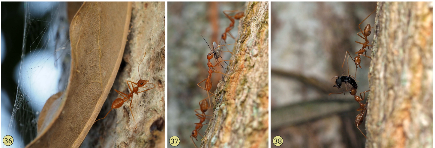
Figures 36-38. Foraging Oecophylla smaragdina near the Herrenia web. 36 , Beneath the Tabebuia leaf occupied by Myrmarachne plataleoides males and females. 37-38 , Carrying captured prey on a nearby vine.

The entire site for these observations was occupied by many foraging Green Tree Ants ( Oecophylla smaragdina ), with a major vertical route on a thick vine to the right side of the Herrenia web (Figures 1, 36-38).