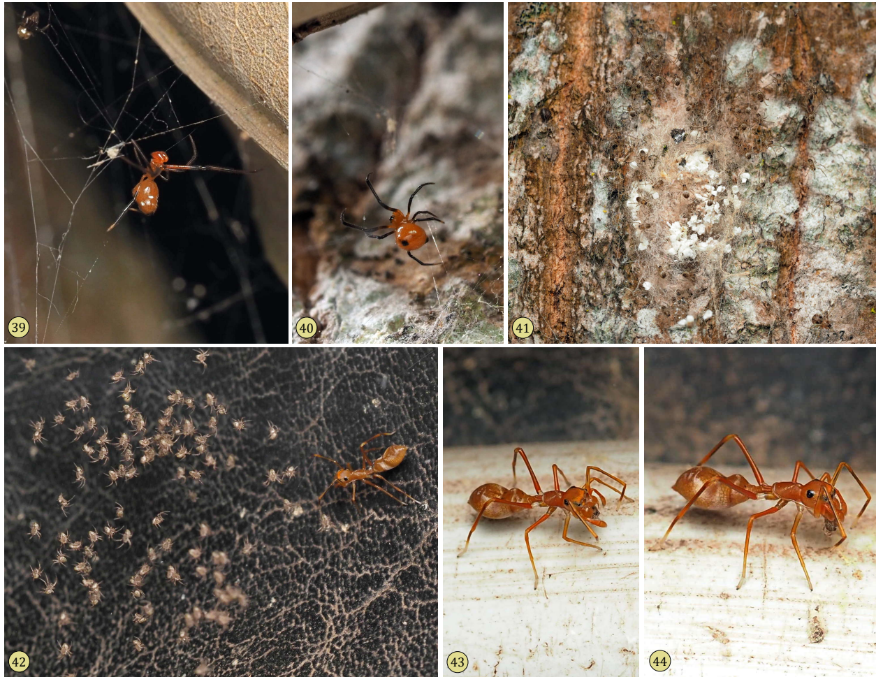
Figures 39-44. 39-40, Male (39) and female (40) Argyrodes , kleptoparasites in the Herrenia web. 41, Emergent Herrenia brood, with small spiderlings moving on silk above the egg case attached to the bark. 42, Female Myrmarachne plataleoides watching an Argiope brood over a man-made surface at a different site. 43-44, Female M. plataleoides capturing and feeding on the Argiope spiderlings.