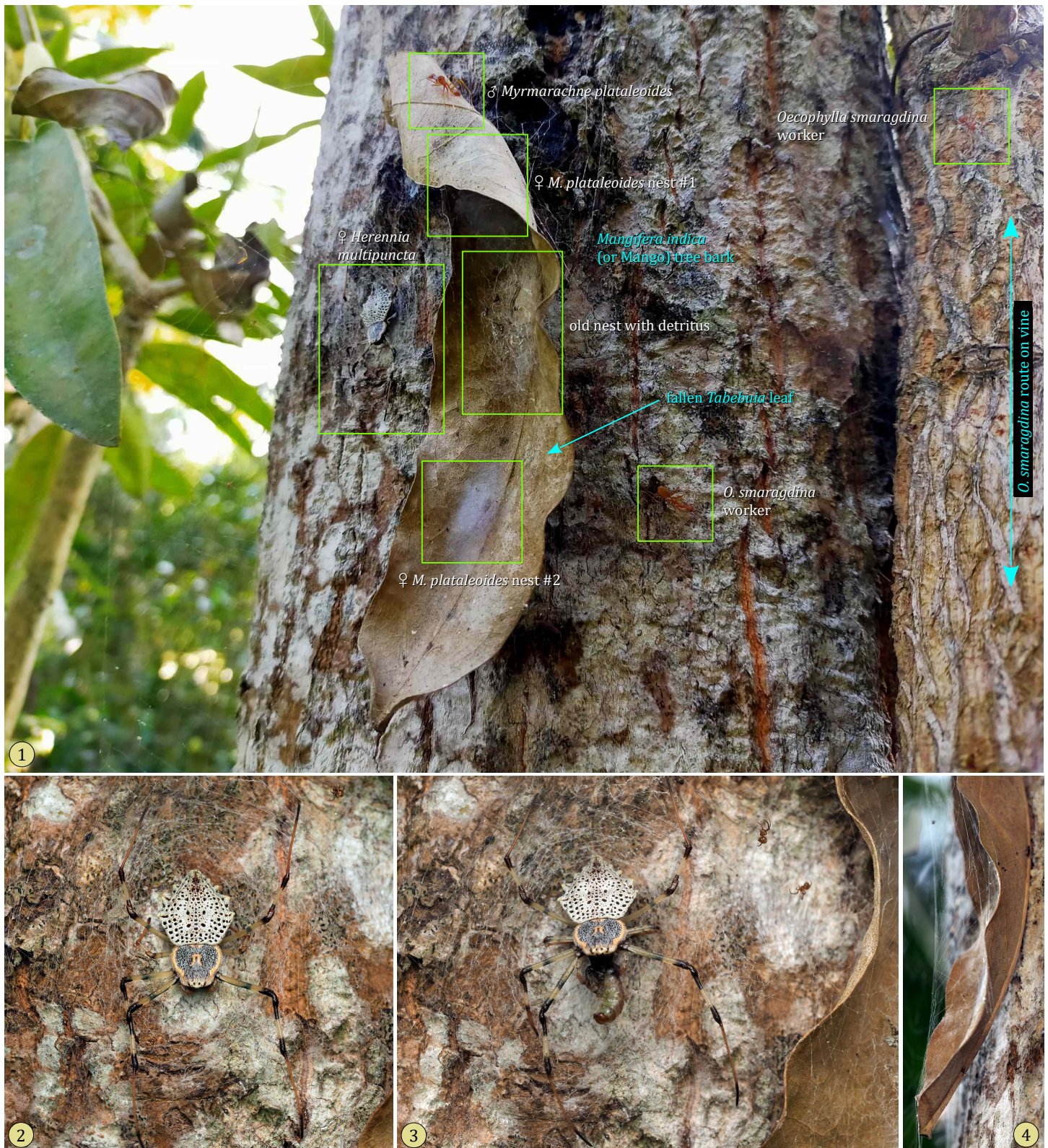
Figures 1-4. 1, Overview of local environment. To the left, an adult female Herrenia multipuncta rested at the center of her web, constructed over bark of a Mango Tree ( Mangifera indica ). Two nests occupied by female Myrmarachne plataleoides , often guarded by males, were constructed on the dry Tabebuia leaf, at center, beneath the Herrenia web. Green Tree Ants ( Oecophylla smaragdina ) frequented this site, with a major vertical route on a vine to the right, populated by rapidly moving ants. An old nest with detritus may have been previously occupied by an M. plataleoides , but this occupation was not observed. 2, Herrenia at the center of her web. 3, Herrenia feeding on a captured caterpillar. Note the two small Argyrodes at upper right. 4, Lateral view showing how the Tabebuia leaf was covered by the web of this Herrenia .