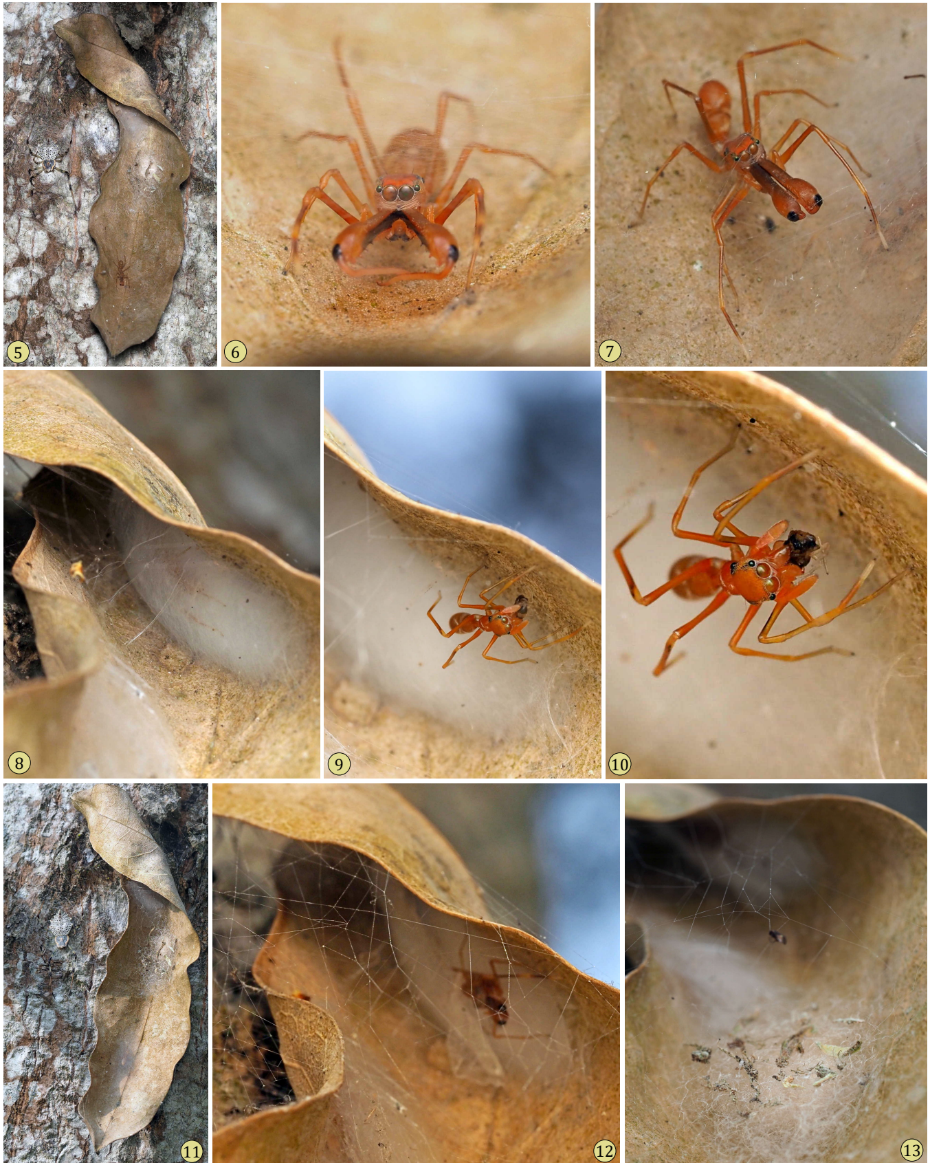
Figures 5-13. 5-7, Male Myrmarachne plataleoides near bottom of the Tabebuia leaf. 8-10, Female M. plataleoides occupying the upper shelter (nest #1), later feeding on what appears to be a small spider (9-10). 11, A second female M. plataleoides has moved into a shelter (nest #2) in a lower position on the Tabebuia leaf. 12, Male M. plataleoides attending female in nest #1. 13, Old nest and debris near the middle of the Tabebuia leaf.