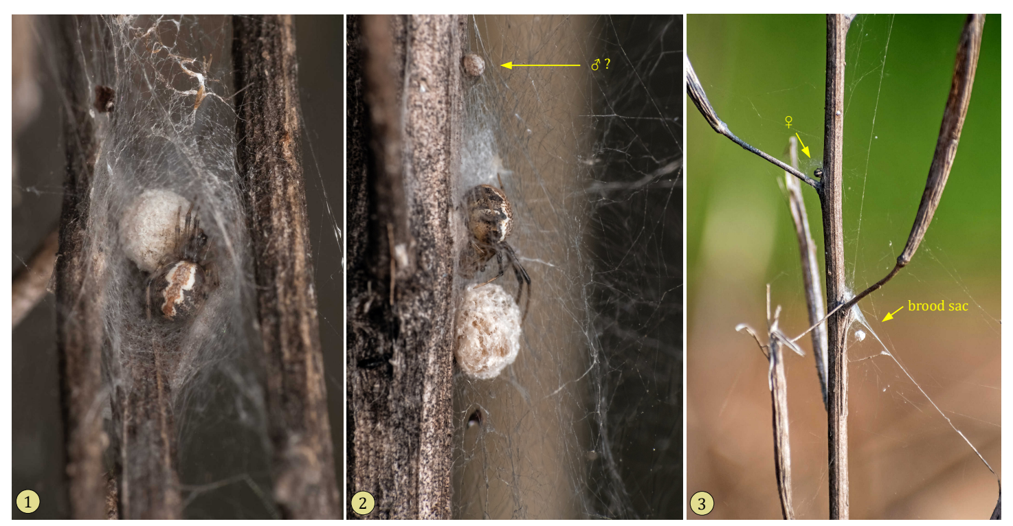
Figure 2. Female theridiids in their webs with brood sacs (egg sacs) between the branches of dry herbaceous plants at Gobichettipalam, Erode, Tamil Nadu (3 SEP 2022). 2, This female may have been accompanied by a much smaller male (arrow). 3, Note the distance between this female and one of her brood sacs.

In the same area many Bianor were observed near a small stream situated near agricultural land. Here small theridiid spiders built their webs between the branches of herbaceous plants, keeping the egg sacs within the webs where they could be guarded by the females (Figure 2).